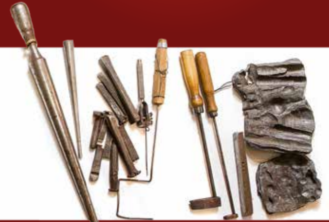
You can find the tools of a goldsmith in an entire-furnished workshop.