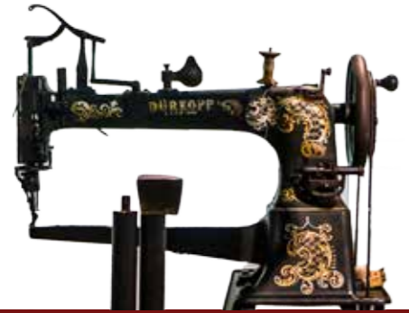
Here you can find the fashion of different centuries.