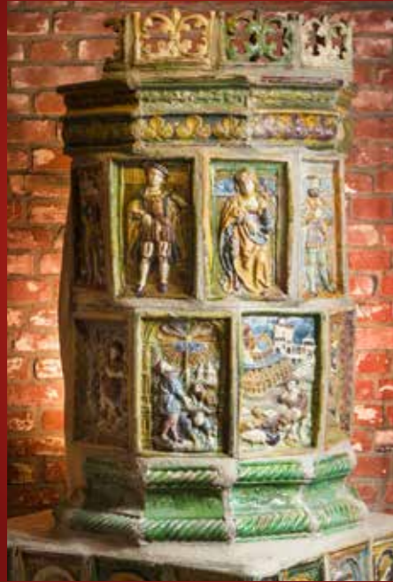
The excursion into the history of Heide starts in the time of the Republic which brought political and economic growth to Heide