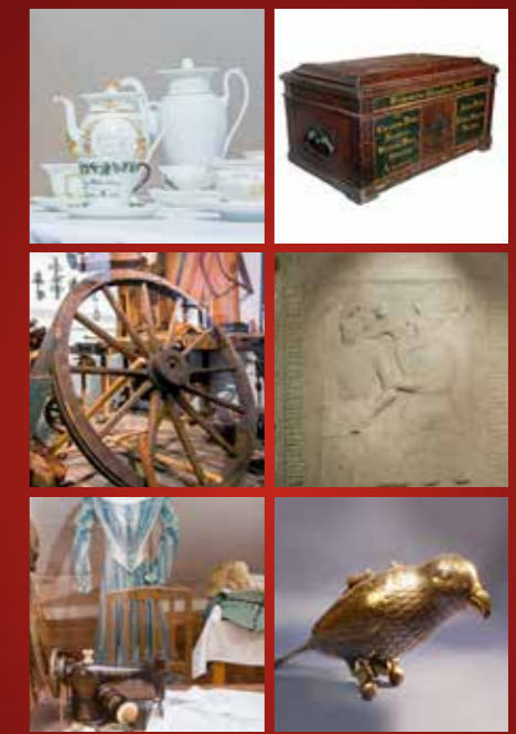
The museum invites the visitor to have a view of the history of Heide in all the rooms.